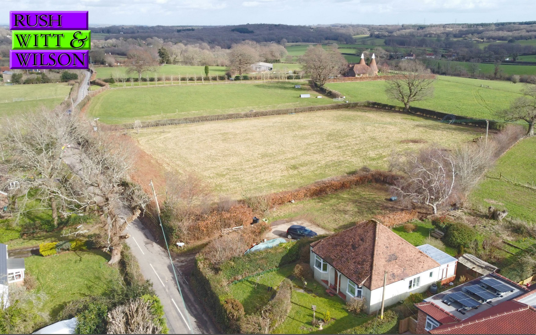
Sunnymead, Beckley Road, Northiam, East Sussex, TN31 6JB. £520,000 Freehold